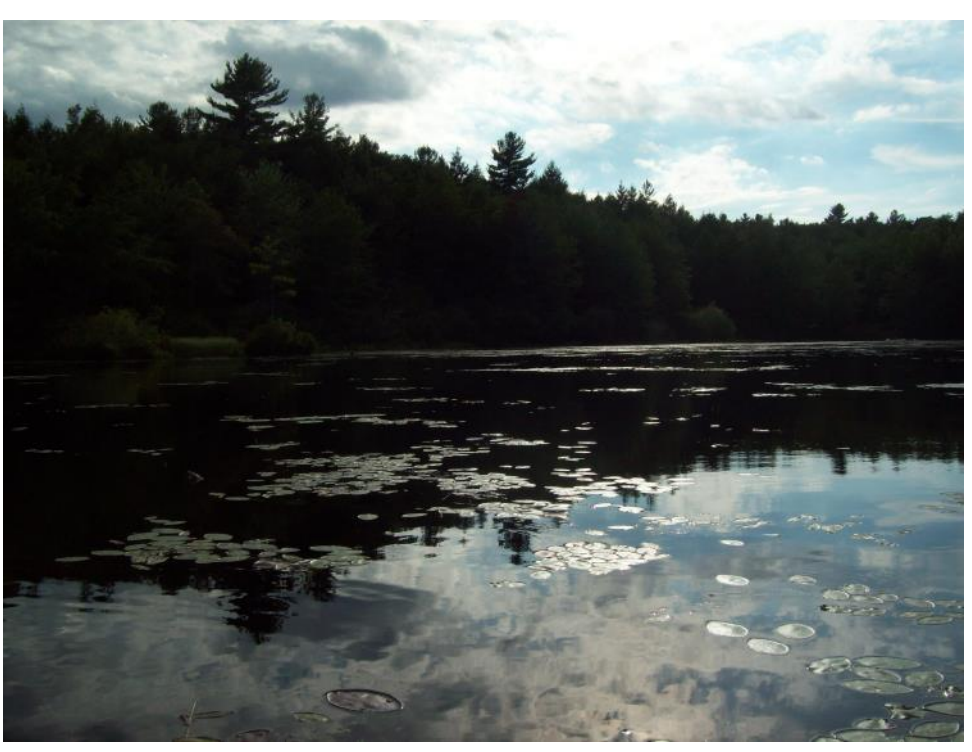
An August evening on Lake Wyola, as enjoyed from a library kayak.