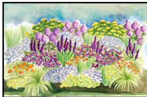
Gardens , continued from page 1

to help? There are two ways you can lend a hand: