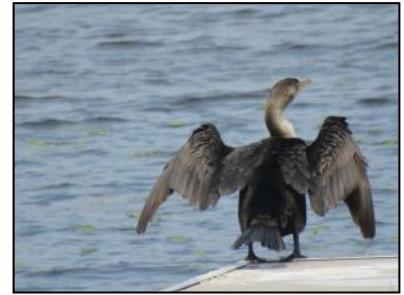
A young cormorant dries off last June after fishing in Lake Wyola.

The race benefits the Lake Wyola Association. Please join them on June 9.