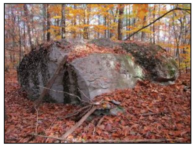
"Meetinghouse Rock" or "Summit Rock" 2019