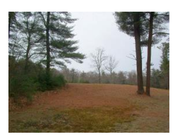
E.P. Pierce monument needing repair and cleaning. Green Burial section of West Cemetery