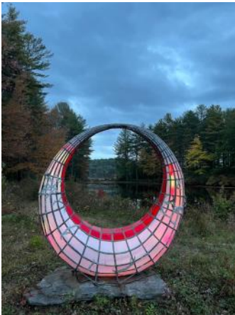
Julian Janowitz sculpture

Ames Pond , located in the north-east corner of town on the unpaved portion of Wendell Road, is well known to those who live nearby as Julian's Bower. Purchased by Julian Janowitz in the 1960s, this unique property features a spectacular mix of wetlands and forest, traversed by several miles of trails leading to a dramatic cliffside overlook. The property includes the 22-acre Ames Pond and its adjoining bog with a thousand-foot-long boardwalk—lovingly built by Julian. The land is also dotted with large sculptures created by Julian