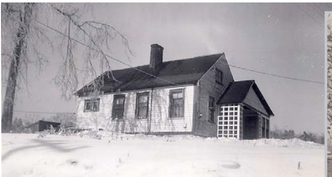
At right: The home and workshop of a manufacturer of hay rakes and wagon wheels on Cross Road, which once ran between Pratt Corner Road in Shutesbury

Below: A house that was moved to West Pelham Road from Prescott Road when the Quabbin Reservoir was created.