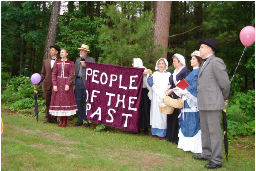
A few of the "People of the Past" assemble before the 250th Anniversary Parade. These and more will perform in character at Celebrate Shutesbury.

Questions? Email him at geddes@comm.umass.edu