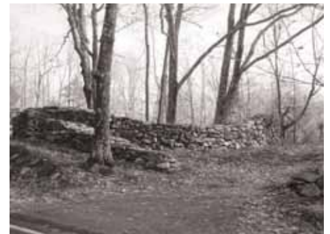
Stray livestock were once held for safekeeping in the Town Pound.

If you have a question about, or an interest in, Shutesbury's history, if