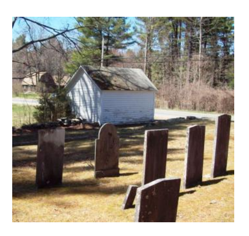
The 1840 Hearse House

A town-owned hearse house reflects a time before there was a funeral industry. The town hearse