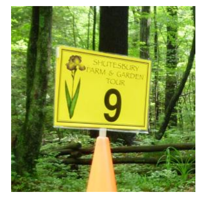
A welcome sign from a 250th Anniversary Farm & Garden Tour in 2011

Would you consider offering yours, or do you know of a great