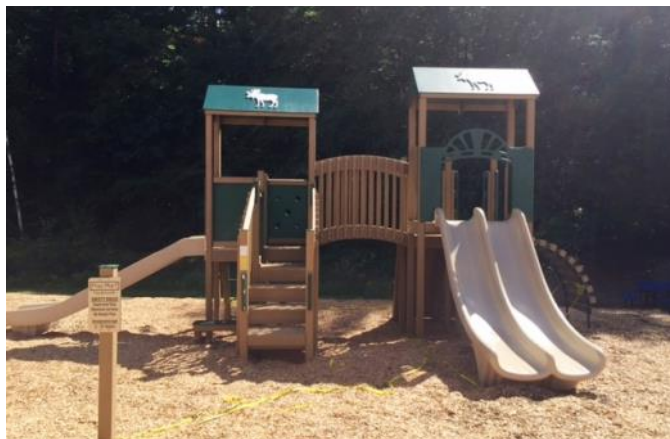
Just one of the structures in the new playground!

The Leadership Team of Union #28 (Superintendent, Director of Student Support Services, Director of Finance