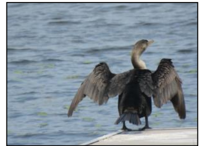
A young cormorant dries off last June after fishing in Lake Wyola.

The race benefits the Lake Wyola Association. Please join them on June 9.