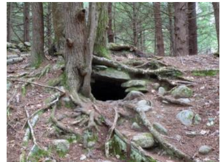
Underground stone chamber, Shutesbury

Learn more about the history of your town! For more info, check https://www.shutesbury.org/historical-commission or email Historical@shutesbury.org . We meet once a month, check the town meeting calendar for next meeting. Thanks!