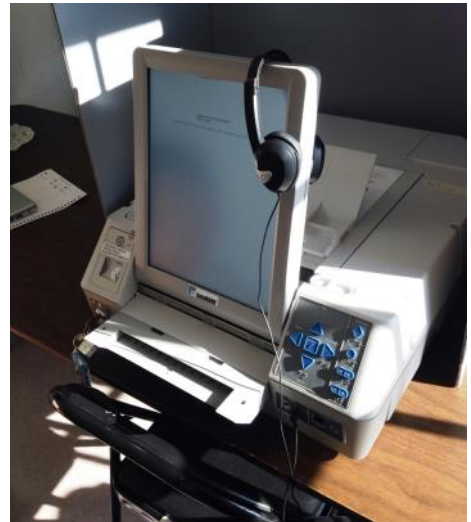
The AutoMARK machine. Technical assistance to independently mark your ballot is available to everyone in Shutesbury.

and mark their ballot independently. Just ask for the AutoMARK ballot at the check-in table. Voters may also bring an assistant or request assistance to mark a paper ballot. We want to help all Americans vote!